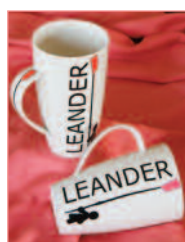
Rowers Mug £15.00