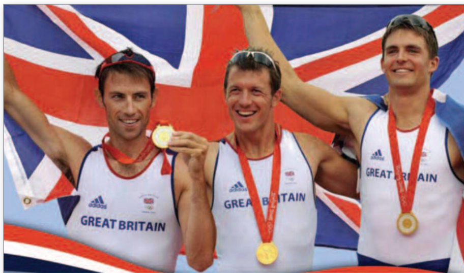
Golden moments in Beijing, but what does the future hold for 2012?

And so we move rapidly towards 2012! As I put pen to paper (or, more accurately, finger to keyboard), there are 849 days left before the opening ceremony in London. The significance of this event for Leander cannot be underestimated and, within the walls of the clubhouse, we are calling this 'Leander's Olympics'. It's a safe bet that the