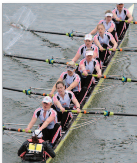
Olympians Lou Reeve and Debbie Flood featuring at stroke and 5 in the Women's Head crew