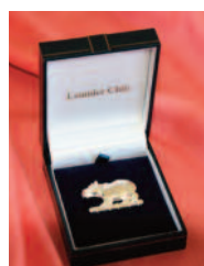
Sterling Silver Hippo Brooch £59.00

To order any or the items above or any other Leander Club gifts please visit our shop website at www.leander.co.uk .