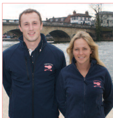
Soft Shell jackets for men and ladies with new logo £69.95