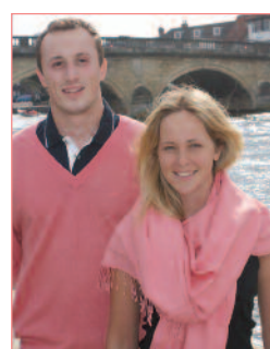
Members pink cashmere pullover and pashmina. £60 each