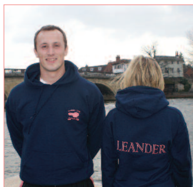
New Unisex Hoodie with back embroidery £32.95

There is a great range of new clothing currently in stock at the Pink Hippo shop, with gifts and children's products coming in all the time. Keep an eye on the website which will be updated as the new stock arrives. Please come and see us at Regatta not forgetting that all the proceeds from the shop go to supporting our athletes so happy shopping!