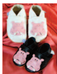
Leather Hippo Baby Booties £16.00