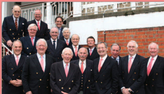
Our Parliament of Owls.

At the start of April, the President hosted a lunch for the Club's 'Wise Owls' – past Presidents, Chairmen, Captains and Trustees: individuals who have not only played a part in the shaping of Leander but also in several cases, a significant role in the development of British rowing. With something like 650 years of experience in the sport gathered together, it is hardly surprising that there was no shortage of opinions after lunch!